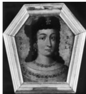
Coffin Portrait of Barbara Domicella Grudzinska, ca. 1676

If you would like to receive an invitation to the gala celebration of Poland's Winged Horsemen, please call (773) 282-8206; dial extension 313 for English, 0 for Polish. Tickets are $150 per person. The dress is black tie optional.