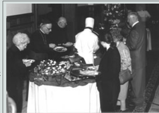
Francis Cardinal George breaks bread with guests at PAA's Chairman's Brunch, held at his historic residence on March 7, 1999.