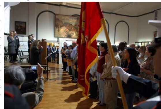
New Citizens Naturalization Ceremony at the Polish Museum of America