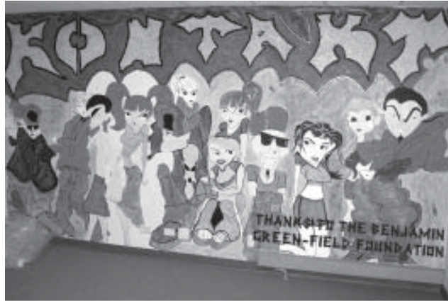
A mural recently painted by the participants of PAA's Teen Development Program at our Southside office. The teens planned and painted the mural that adorns their meeting space.

personal issues in a confidential and supportive setting. Through a series of theater workshops, presented by a volunteer actress, the youth participants also have been introduced to exercises and games that help them to express their ideas and emotions and have found support and friendship in a cooperative